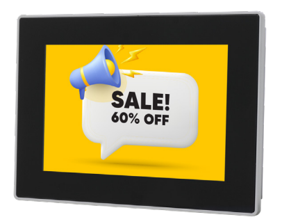
Front of POS-PRO 7.0 Monitor