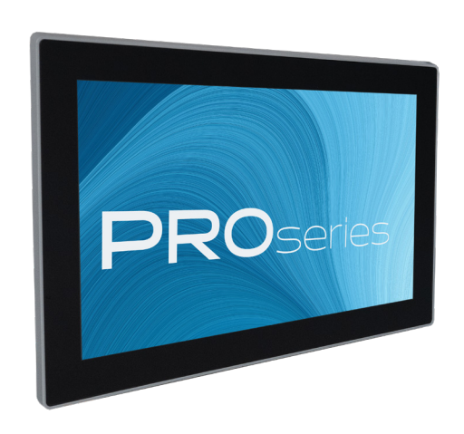
Monitor POS-PRO 7.0 front view

All figures are typical values. The real values of the panel may vary. The optical characteristics are determined after the panel has been "ON" for approximately 30 minutes at an ambient temperature of 25^{\circ} C ( 77^{\circ} F).