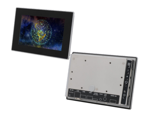
Backside and front of POS-PRO 7.0 Monitor